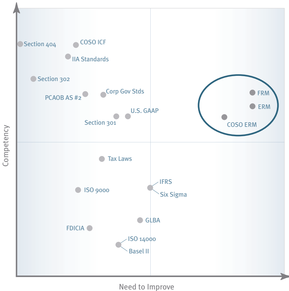
Figure 1: General Technical Knowledge – Perceptual Map